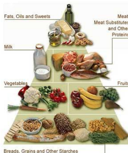
Diabetes Food Pyramid

The basic requirement for the degree is the completion of 64 semester credits as outlined below. Of the 64 credits required for the degree, at least 30 must be completed in residency at Leech Lake Tribal College. No more than 34 transfer credits may be accepted from other institutions in order to meet the requirements for the degree.